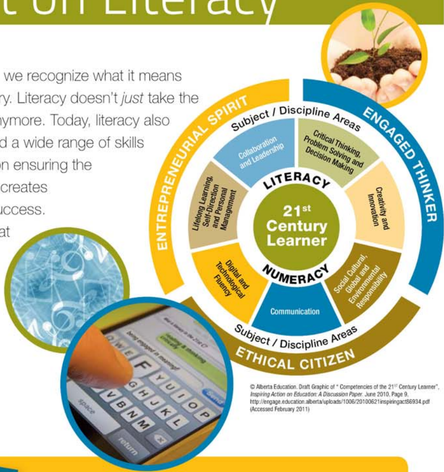
© Alberta Education. Draft Graphic of "Competencies of the 21 st Century Learner", Inspiring Action on Education: A Discussion Paper , June 2010, Page 9. http://engage.education.alberta.ca/uploads/1006/20100621inspiringac186934.pdf (Accessed February 2011)

At Edmonton Public Schools, we recognize what it means to be literate in the 21 st century. Literacy doesn't just take the form of reading and writing anymore. Today, literacy also involves helping students build a wide range of skills and abilities. We're focused on ensuring the knowledge they acquire now creates a foundation for their future success. We live in a dynamic world that offers amazing opportunities to learn, progress, and innovate. We want to see our students make the most of these opportunities.